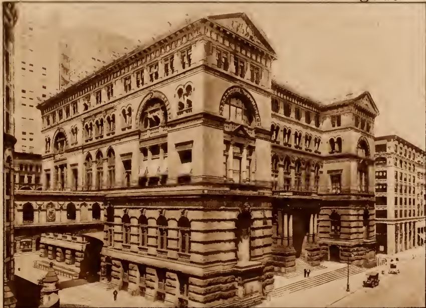
CRIMINAL COURT BUILDING. Here are located the District Attorney and Courts.